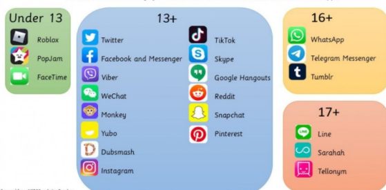
Age Restrictions for Social Media Platforms What is the minimum age for account holders on these social media sites and apps?

Can we also please remind parents that all video games and social media apps have a minimum age limit.